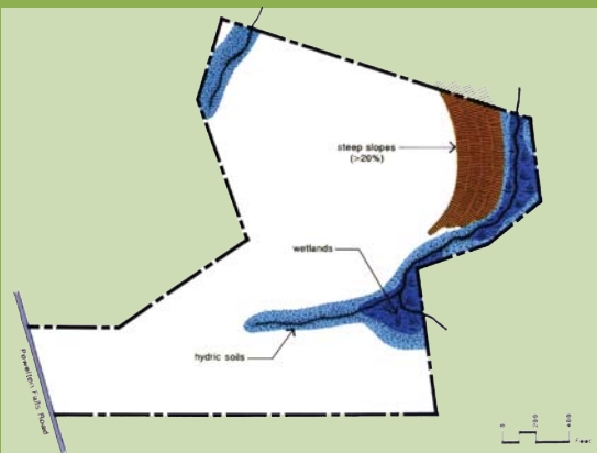
Site Identifying Primary Conservation Areas

government officials and developers in the early 1990s. In his 1996 book, Conservation Design For Subdivisions: A Practical Guide To Creating Open Space Networks , Arendt lays out a four-step process for design and development of an actual site.