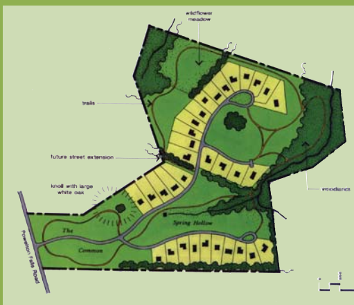
Site With Conservation Design

that can include land that is most sensitive environmentally, most significant historically or culturally, most scenic or which possess unusual or rare attributes.