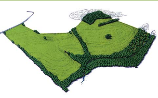
Site Before Development