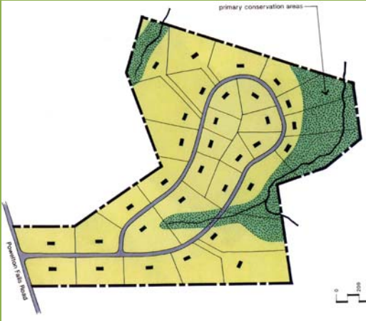
Site With Conventional Design