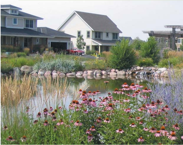
The Fields of St. Croix